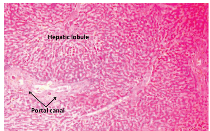
[Table/Fig-3]: Photomicrograph of the accessory lobe of the liver (H&E staining, 10x10 magnification)